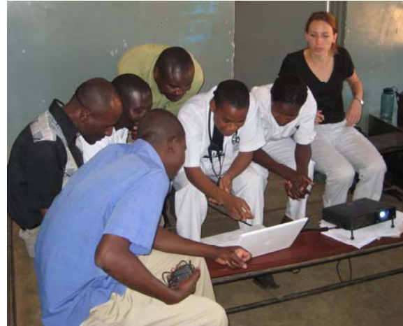
Footer: UpToDate training session in Malawi

Keywords: online medical content, healthcare information, medical information resources